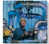
Spares & Service