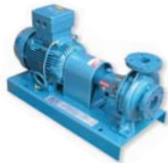
Water & Industrial